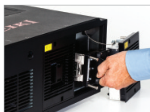
Easy to change long-life lamp.