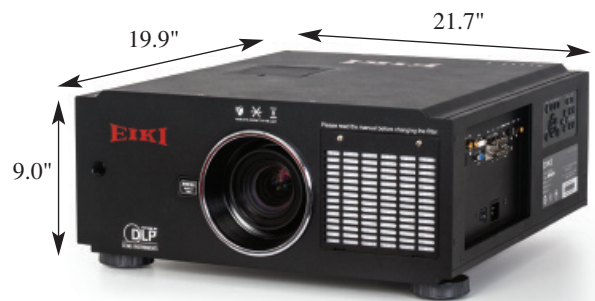
EIP-XHS100 • XGA projector.