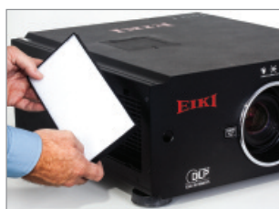
Handy access to air filter.