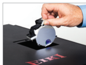
Easy access to color wheel.