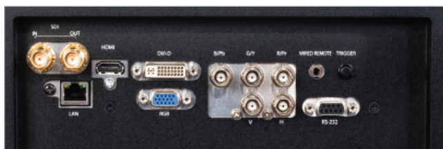
Includes a full complement of connections, including network control.

EIKI® is a registered trademark of EIKI International, Inc. Kensington® is a registered trademark of ACCO Brands Corporation.